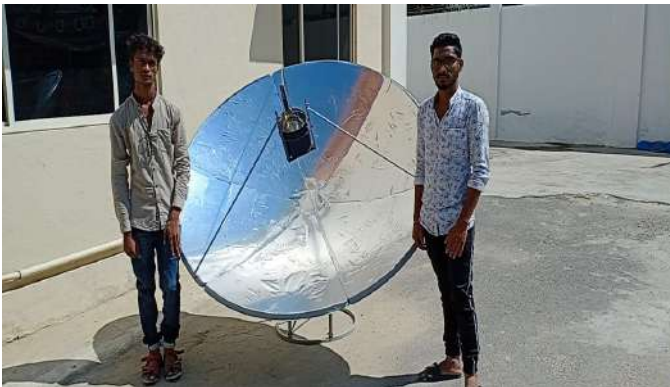
C. Solar cooking utensil