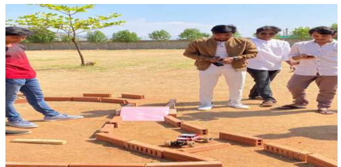
D. Line Follower

Department of Mechanical Engineering conducted CAD Modeling, Poster Presentation, Tug of war and Line follower as part of AMPLE-2020 on 20-02-2020