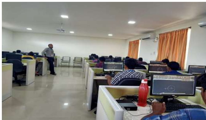
A. CAD Modeling

Department of Mechanical Engineering conducted Project Expo on 19-02-2020 in connection with AMPLE 2020.