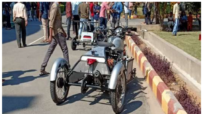
D. Tri wheel Grass cutter

Department of Mechanical Engineering conducted Project Expo on 19-02-2020 in connection with AMPLE 2020.