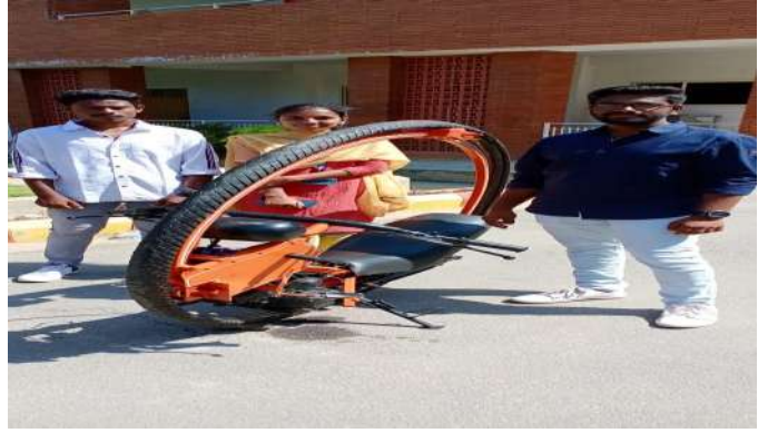
B. Mono Wheel