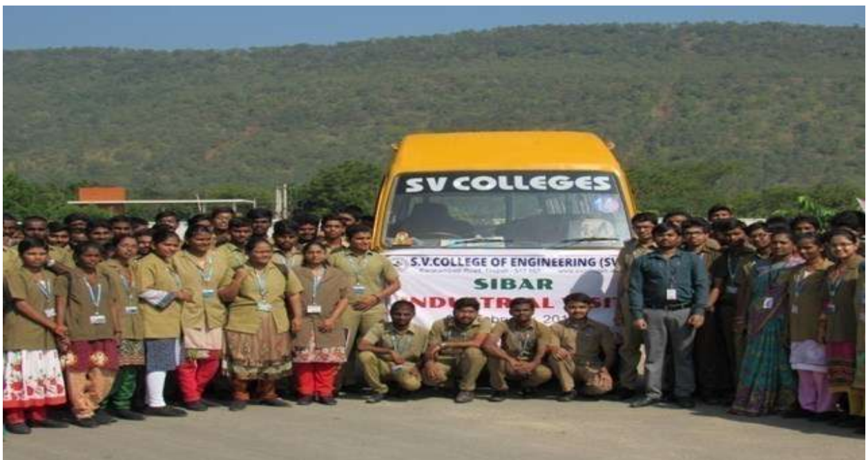
A One day industrial visit Programme conducted on 27-02-2020 by II ME students to “SIBAR AUTOPART LTD.,” Renigunta.