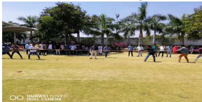
C. Tug of war