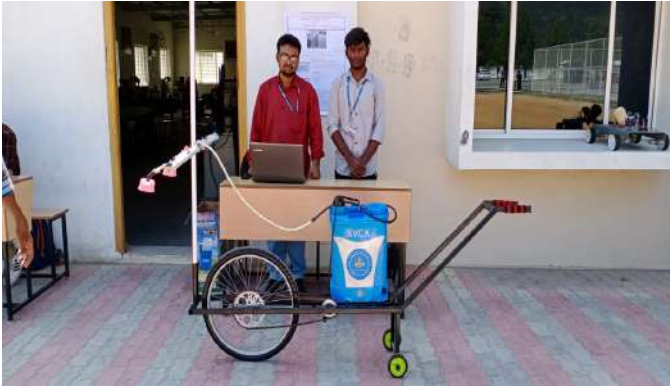
A. Automatic sprayer