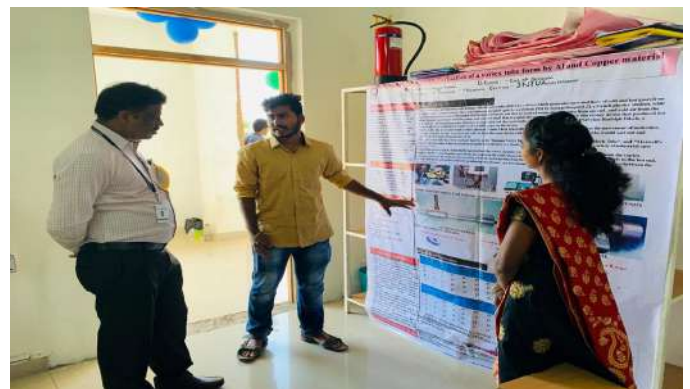
B. Poster Presentation