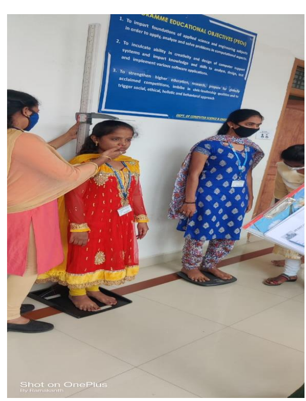
Awareness on Health & Diet