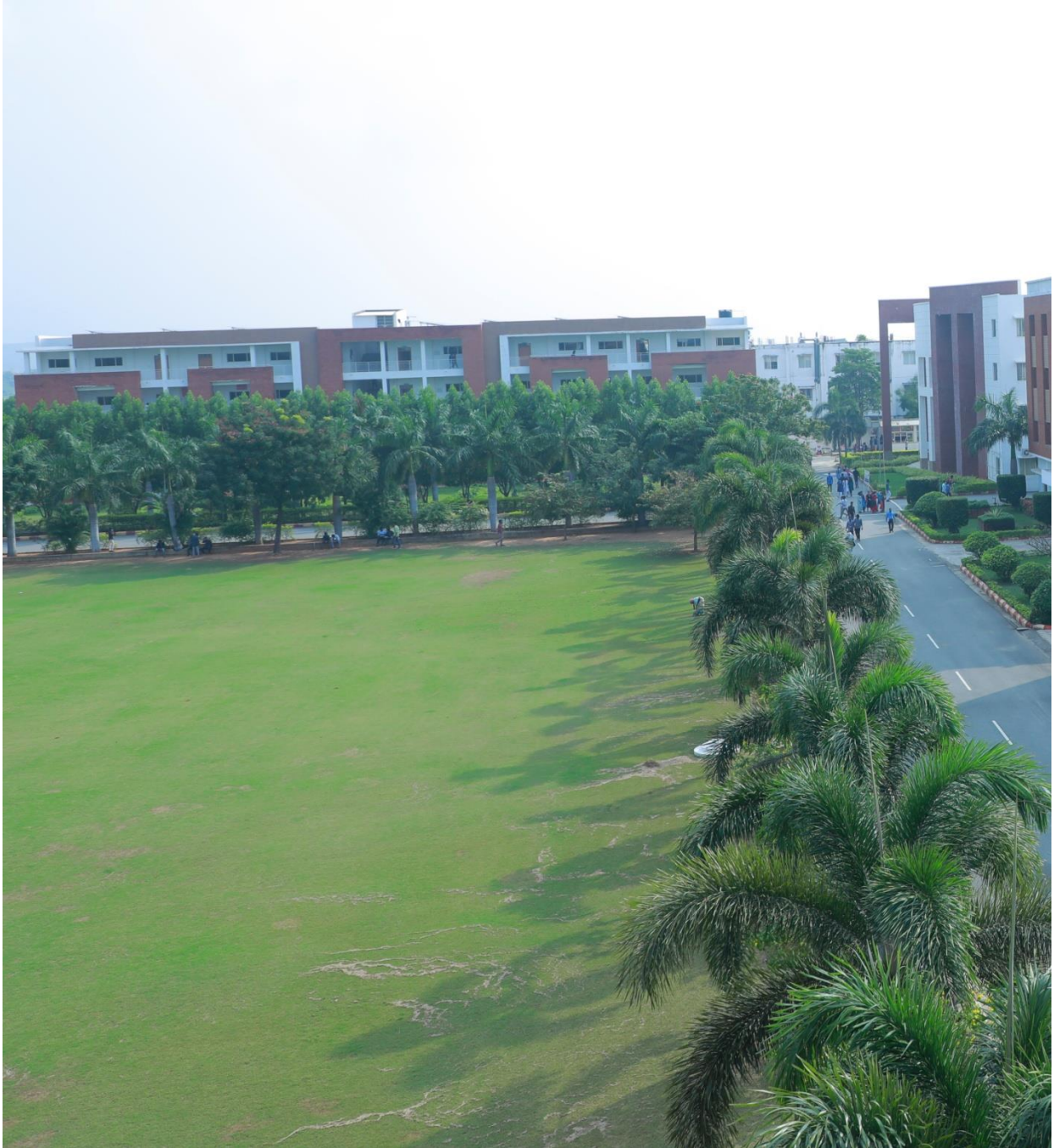
BLOCK- III & IV