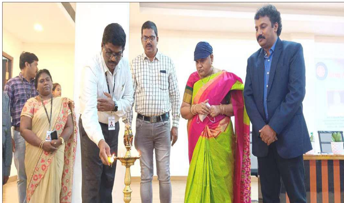
Lightening the lamp