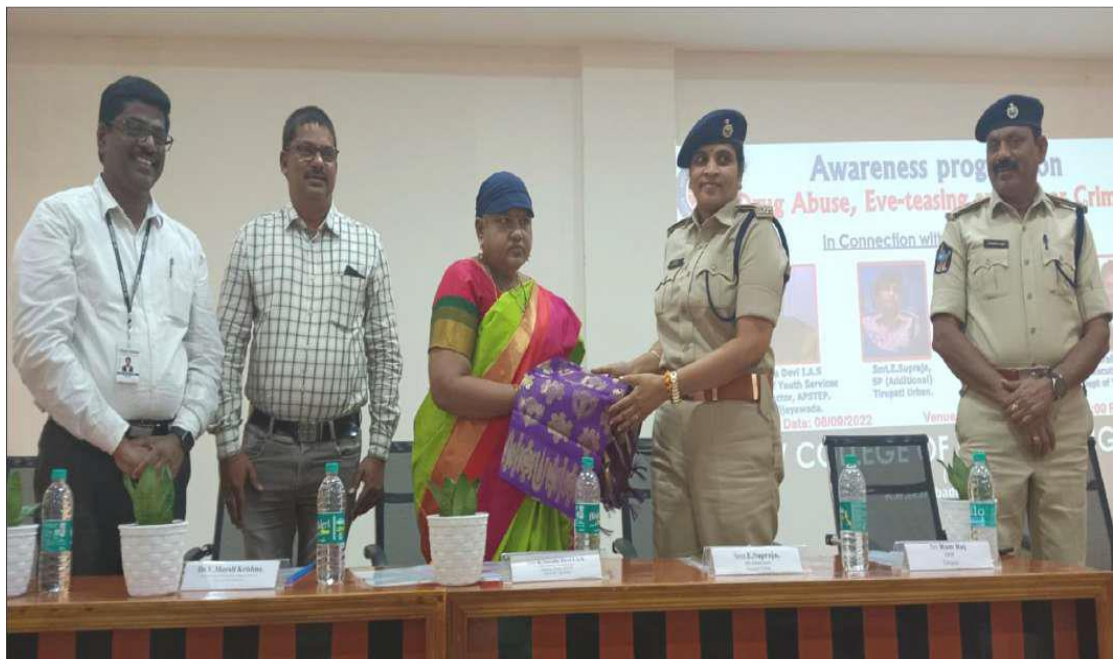
Honoring the Chief guest with a Shawl & Memento