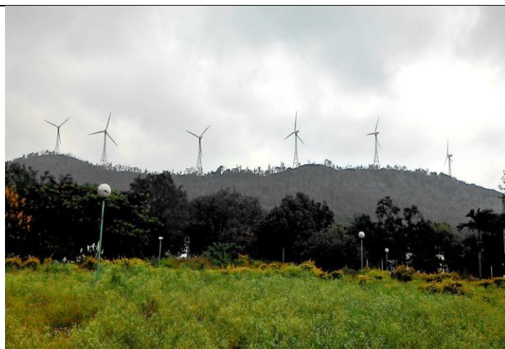
Wind Power Plant