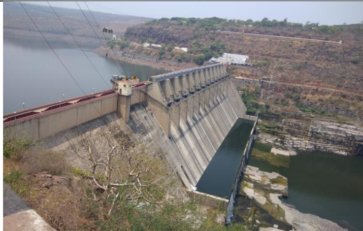
Srisailem Right Bank Power House

Karakambadi Road, Opposite LIC Training Centre, Tirupati – 517 507. Accredited by NBA (B.Tech – CSE, ECE,EEE,Mech.,Civil and IT) & NAAC with 'A' Grade Approved by AICTE, New Delhi permanently affiliated to JNTUA, Ananthapuram.