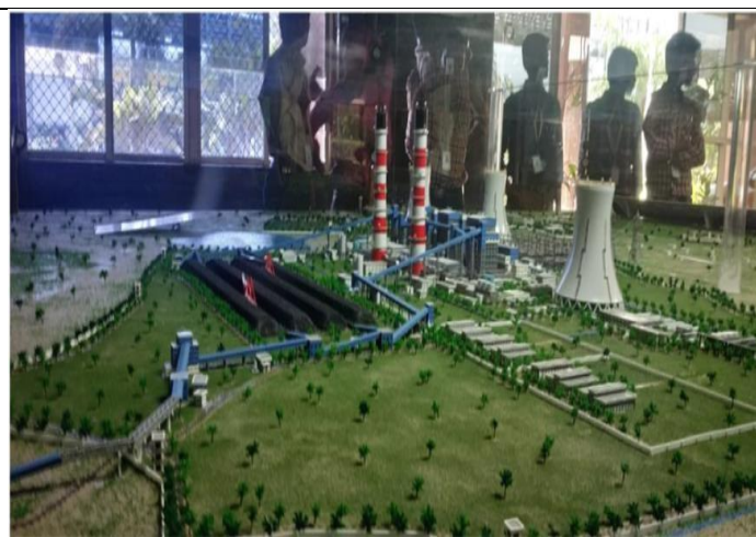
Damodaram Sanjeevaya TPP