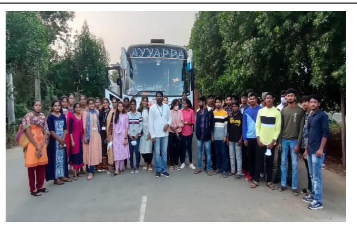
Somasila Power Plant Visit