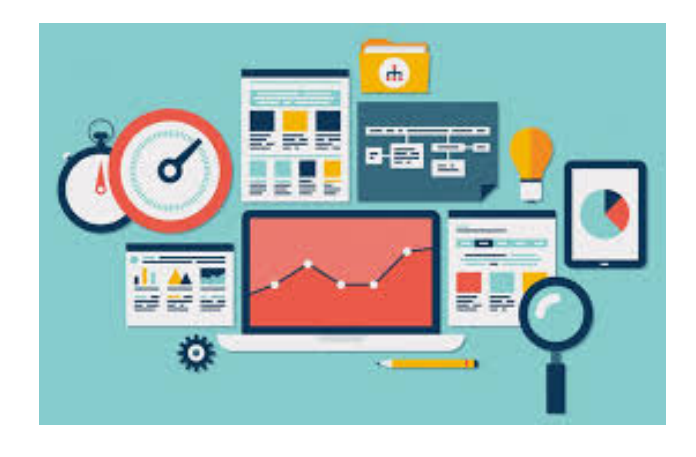
Training Programs in Advanced Technologies