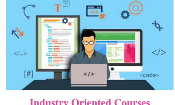
Industry Oriented Courses