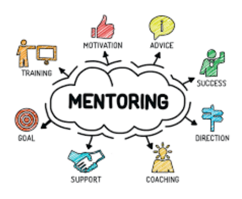
Effective Mentoring System For Students