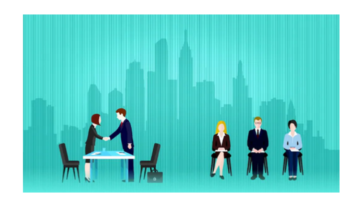
Excellent Success rate in Placements