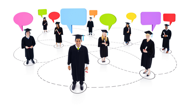
Strong Presence of Alumni