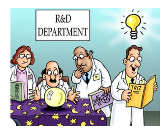
R & D and Knowledge Sharing Centre